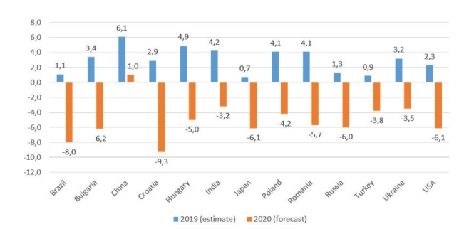
Figure 1. Change in GDP for 2020 (according to the World Bank, average annual values [26])

Figure 1 shows the change in GDP in 2020 in terms of countries.