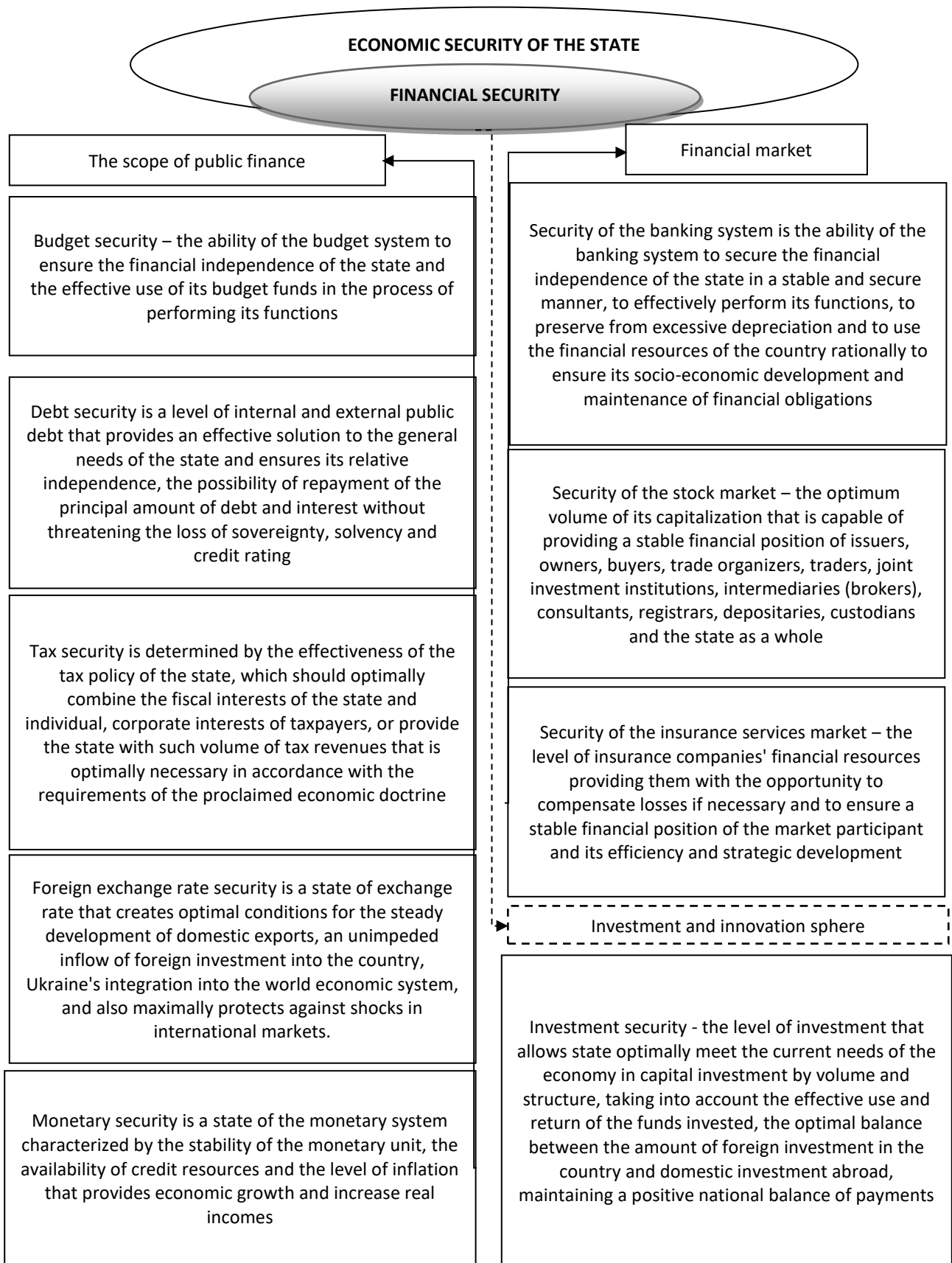
Figure 1 – Components of the system of financial security of the state